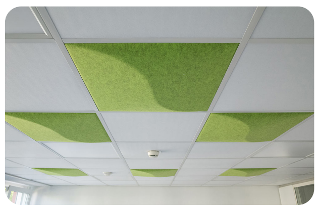
Ceiling design with soni COLOR Design YinYang